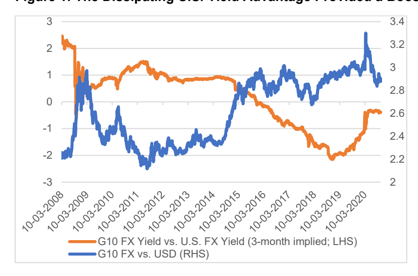
Figure 1: The Dissipating U.S. Yield Advantage Provided a Boost to G10 FX Performance vs. the U.S. Dollar

A stark dichotomy in global monetary policies was evident between 2014 and 2019. The Federal Reserve's balance sheet (as a % of GDP) peaked in mid-2014 shortly before its most recent rate-hiking cycle, while other major central banks generally remained in policy-easing mode. But the COVID pandemic and the globally synchronized monetary stimulus leveled the view across central bank policies. As a result, the short-term yield gap between the U.S. and the rest of the G10 closed, providing a jolt to G10 FX performance vs. the U.S. dollar (Figure 1).